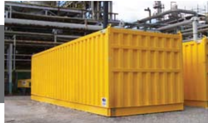
GML 12' x 40' BRM on site at ExxonMobil Chalmette Refining, LLC Petrochemical Facility

General Marine Leasing Portable Blast Resistant Modules are fabricated using a specially designed reinforced cold form steel beam and column system for protecting workforces and equipment at and around petrochemical facilities. This unique framing system provides increased levels of resistant for the support of vertical and horizontal loads normally associated with accidental petrochemical and refinery explosions. General Marine Leasing Portable Blast Resistant Modules use 6" x 6" upper frame tubing and 6" x 2" center frame tubing surrounding, reinforcing the entire Portable Blast Resistant Module. C-Crimp 1/4 steel plate encloses the reinforced framing, providing an increased level of overpressure reflection.