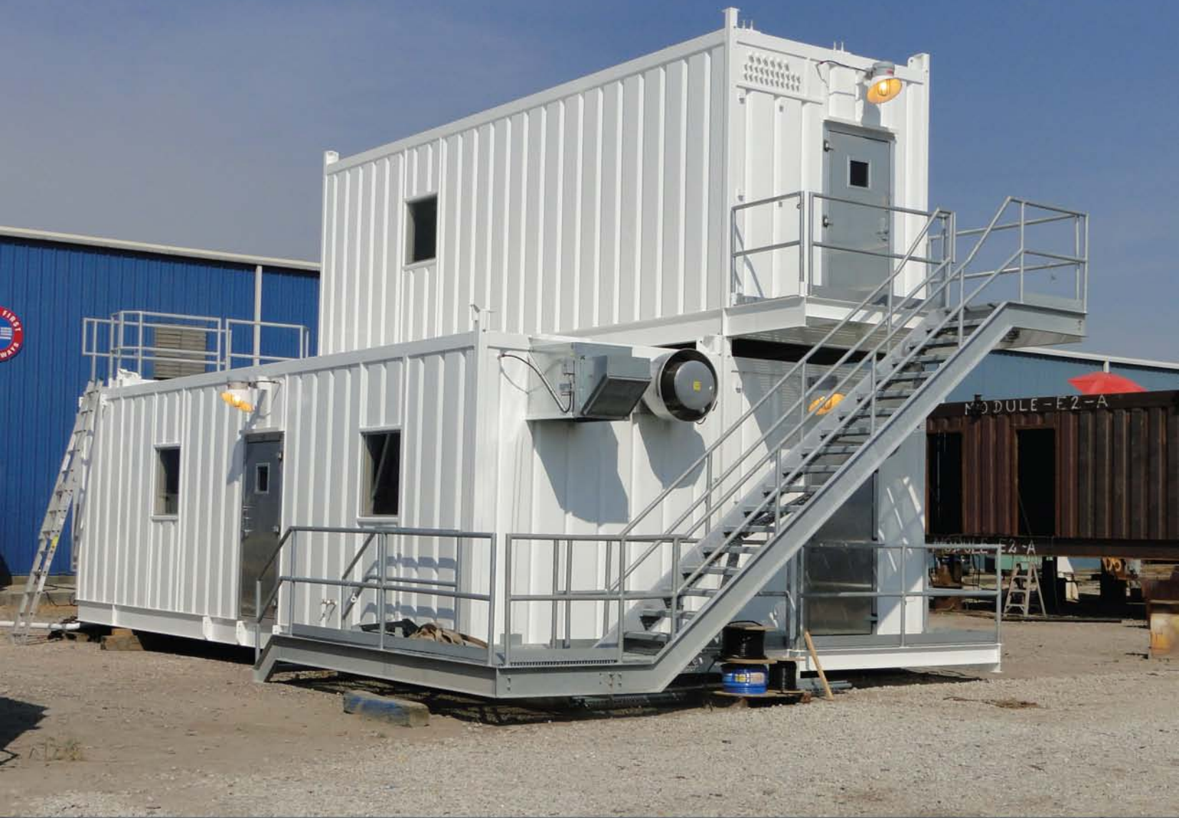
(3) Unit Complex: Living Quarters, Office, & Galley Diner