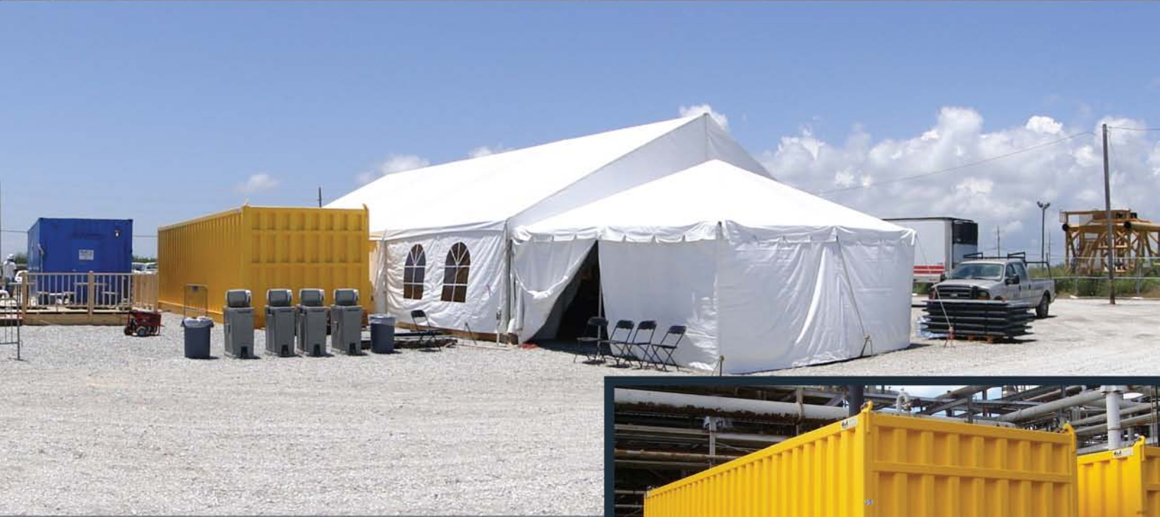
Emergency Response Camp Venice, LA