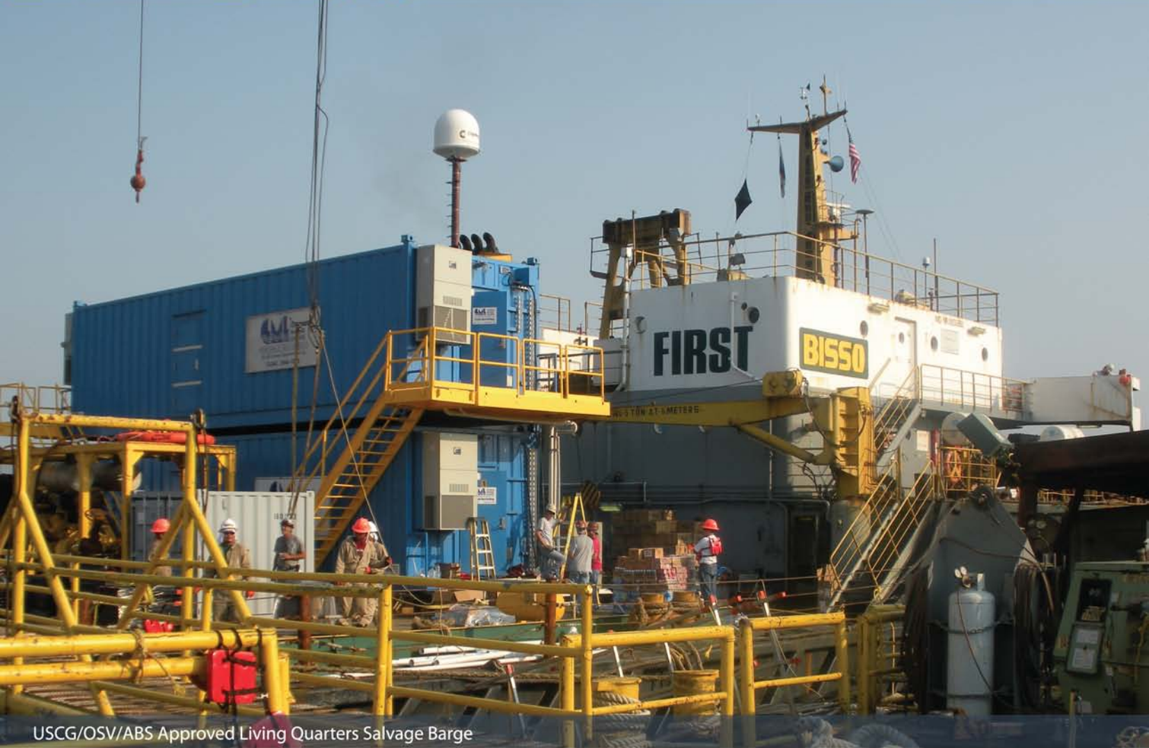
USCG/OSV/ABS Approved Living Quarters Salvage Barge