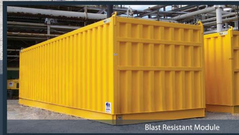
Blast Resistant Module