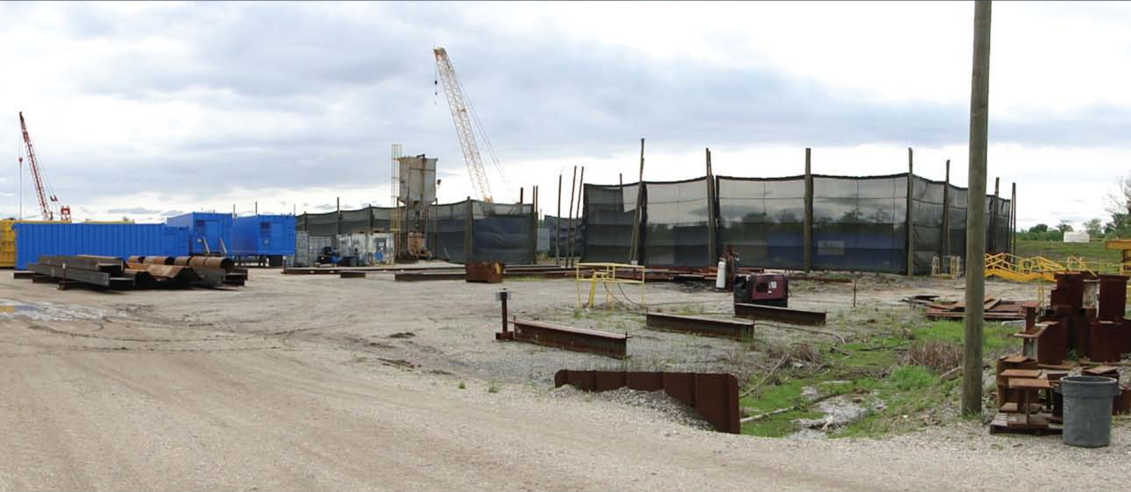
Fabrication Facility Belle Chasse, LA USA